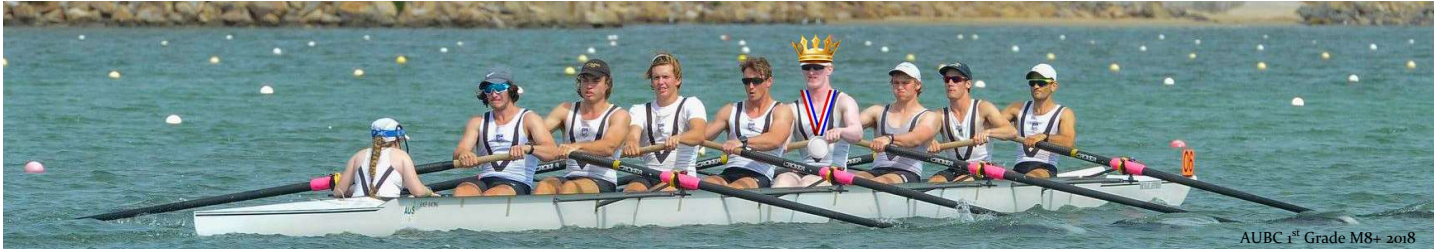
AUBC 1 st Grade M8+ 2018